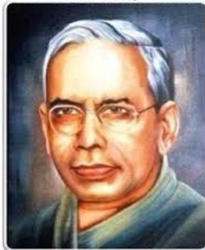
Dr. S. R. Ranganathan